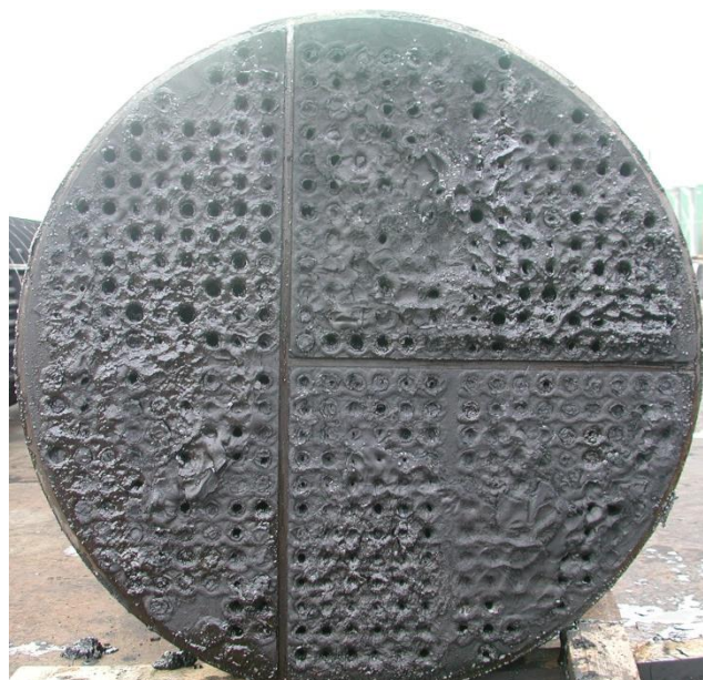
Figure 2 Typical clogged tubes of a S&T exchanger.

Heat exchanger manufacturers are presently under increasing pressure to produce heat exchangers which are more efficient in terms of heat recovery and use of material, while at the same time being faced with fluids which are increasingly difficult to process. One major problem directly related to these requirements is the deposition of unwanted materials on the heat transfer surfaces, which occurs in the majority of heat exchangers [2]. Conservative studies estimated that heat exchanger fouling leads to additional costs in the order of 0.25% of the GDP of industrialized countries, and that it is responsible for 2.5% of the total equivalent anthropogenic emissions of carbon dioxide [3]. Moreover, The worldwide costs of fouling is estimated to be approximately B$60 per annum [3]. Therefore, efficient mitigation and cleaning methods must be available to safe-guard the operation of heat exchangers.