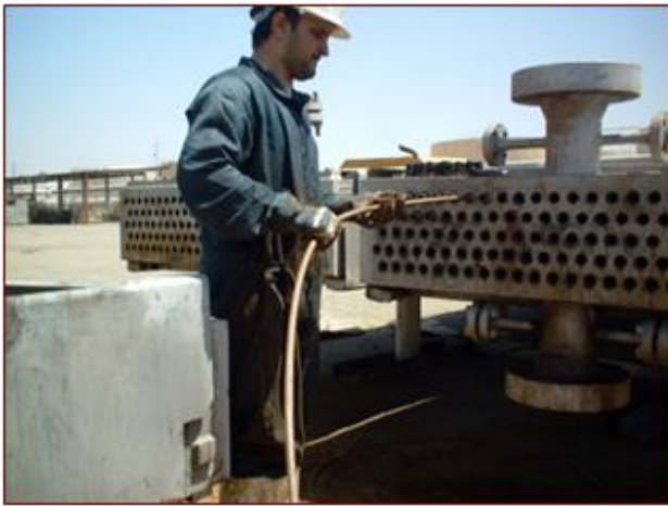
Figure 3 The Sisaco electro-hydrmechanic cleaning device in operation highlighting the device flexibility