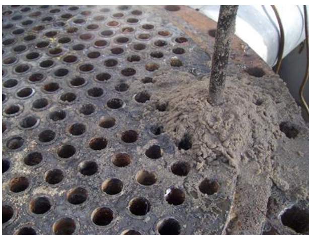
Figure 4 The Sisaco electro-hydrmechanic cleaning device in operation highlighting the disposal of removed deposits.