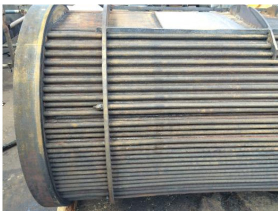
Figure 2 - The space between the tubes in a heat exchanger bundle is an example of a region that is difficult to access for cleaning, especially at the inner diameter of the bundle.

with hydroblasting suggests that badly fouled bundles are never cleaned completely on the shell side, and that a return to service at less than 80% of design heat transfer performance is common, particularly for large bundles.