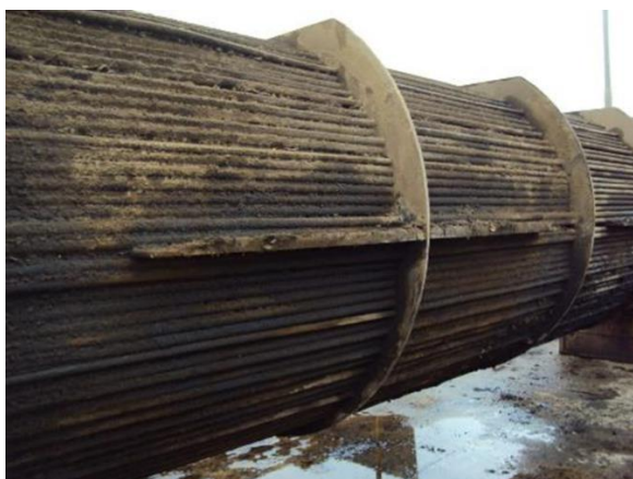
Figure 5 – Example of fouling on Quench Oil Exchangers

Some of the equipment identified as having the greatest potential for ultrasonic cleaning, both for the impact on the process and for the difficulty of cleaning with conventional methods, were quench oil exchangers (one of the fluids used for cooling the effluent areas in olefin plants), shown in Figure 5. Typically, a lot of fouling is formed on the outer side of the tubes (commonly called the "shell side") of these exchangers, which significantly decreases their performance. The same situation has been identified for several other exchangers with fouling on the shell side in other areas of the plants. Due to the geometric configuration, hydroblasting cleaning is only partially efficient as it is not possible to access the tubes further towards the center of the bundle. Thus, incomplete recovery of heat transfer efficiency is observed after cleaning the equipment with hydroblasting. Our hope was that due to the nature of ultrasonic cleaning, such incomplete restoration would not be observed, and that the new cleaning method would return the performance to levels comparable to that of new equipment.