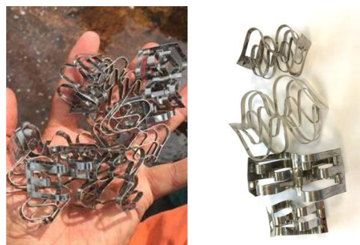
Figure 12. Packings after ultrasonic cleaning.