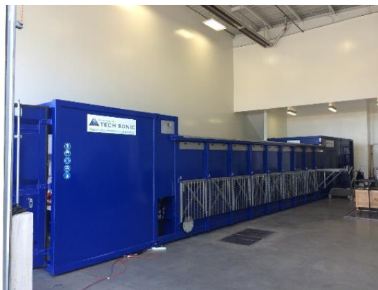
Figure 6 – The first Braskem System in the manufacturing plant in Canada

The equipment was designed and built in 16 weeks, and delivery took an additional 60 days with a streamlined importation process to arrive in Bahia in September, just prior to the turnaround.