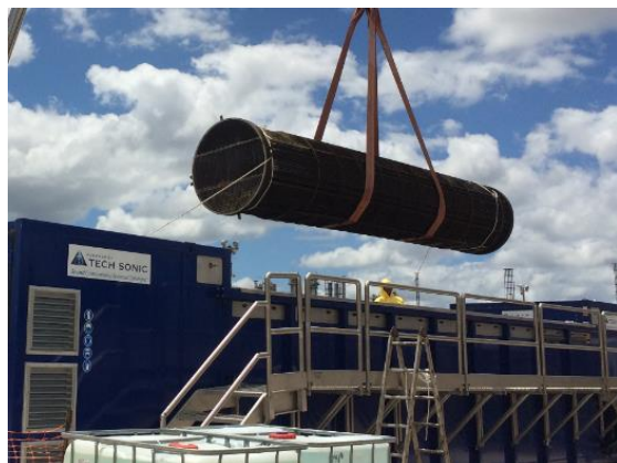
Figure 7 – The first bundle being placed in the ultrasonic bath in Bahia

The equipment was then installed in the Braskem washpad in Bahia and put into operation, first with routine equipment released for cleaning (during normal plant operation) and then with equipment released during the turnaround (Figure 7). The results obtained are discussed in the sections below.