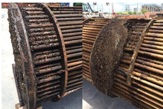
Figure 8. Butadiene fouling in the test exchanger bundle before cleaning.