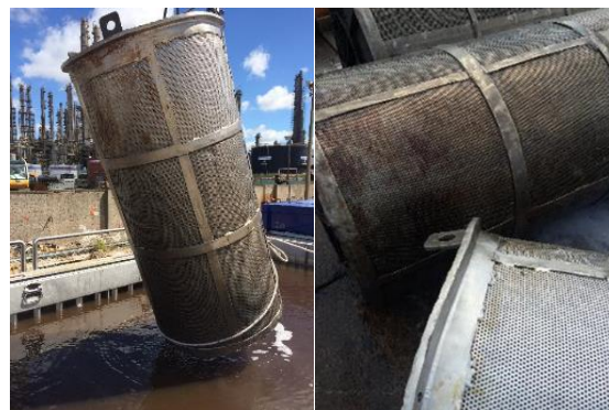
Figure 10. Cleaning filter baskets using the ultrasonic bath, and a comparison of filter baskets cleaned with hydroblasting (rear) and ultrasonics (foreground)

We also noted success in cleaning other types of components. In particular, column packings and filter baskets were cleaned. A direct comparison of the results of cleaning filter baskets with hydroblasting vs. ultrasonic shows a striking difference in the ability of the method to remove fouling to the metal surface (Figure 10).