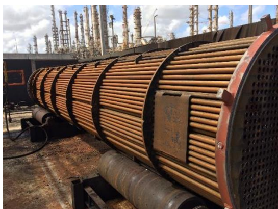
Figure 9. The test bundle after ultrasonic cleaning and rinsing.

Other exchangers were mapped with high gain potential due to higher cleaning efficiency. They are components of a system of several exchangers released during normal plant operation, not as part of maintenance shutdowns. The effect can only be measured after cleaning all the system exchangers, which will take several months to occur (because the heat exchangers are released in pairs, gradually according to the plant's operating conditions). Among these exchangers are those of quench oil. The calculated value for the steam savings after cleaning of all the system exchangers is $1.35 M USD per year. In addition, rinsing with an oil stream produced in the unit for cleaning these exchangers is now used. With the best level of cleaning from the ultrasonic technique, this oil stream could be marketed. The estimate is 500t per year, valued at $720,000 USD.