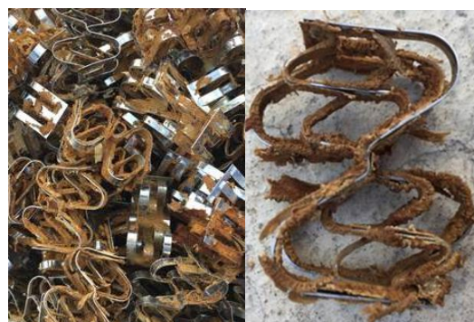
Figure 11. Fouled tower packings before cleaning

We also cleaned a small batch of column packings which would be impossible to clean efficiently with hydroblasting. The ultrasonic methodology was able to remove fouling from the packings with 100% effectiveness as shown in Figure 11 & 12.