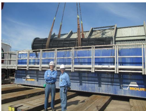
Figure 5. Visiting a plant in the Netherlands to verify the technique

Some of the equipment identified as having the greatest potential for ultrasonic cleaning, both for the impact on the process and for the difficulty of cleaning with conventional methods, were quench oil exchangers (one of the fluids used for cooling the effluent areas in olefin plants), shown in Figure 5. Typically, a lot of fouling is formed on the outer side of the tubes (commonly called the "shell side") of these exchangers, which significantly decreases their performance. The same situation has been identified for several other exchangers with fouling on the shell side in other areas of the plants. Due to the geometric configuration, hydroblasting cleaning is only partially efficient as it is not possible to access the tubes further towards the center of the bundle. Thus, incomplete recovery of heat transfer efficiency is observed after cleaning the equipment with hydroblasting. Our hope was that due to the nature of ultrasonic cleaning, such incomplete restoration would not be observed, and that the new cleaning method would return the performance to levels comparable to that of new equipment.