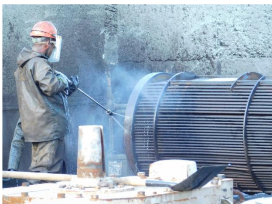
Figure 1 - Examples of hydroblasting being applied in cleaning heat exchangers

with hydroblasting suggests that badly fouled bundles are never cleaned completely on the shell side, and that a return to service at less than 80% of design heat transfer performance is common, particularly for large bundles.